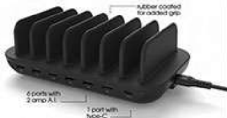
POCKET-MULTI-USB see page 15