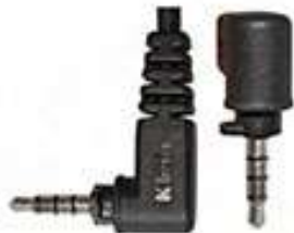
XP3 Patent pending design